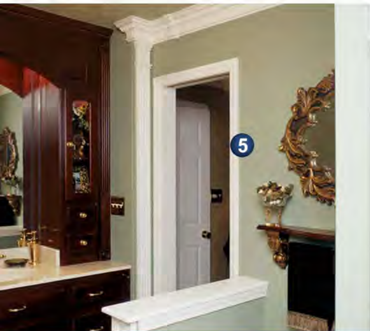
Fypon trim pieces help define and accent different areas of the bathroom.

Fypon products abound in the graceful bathroom. A small Wall Niche holds a decorative statue. Brackets have been faux finished and serve as a towel rack. A Raised Window Panel with added Chair Rail Moulding completes the pilaster-and-moulding tub enclosure. And, a Dentil Egg and Dart Miterless Crown Moulding System neatly surrounds the entire room.